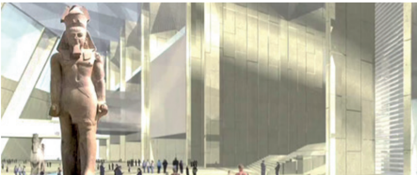
The colossus of Ramses II will welcome the visitors of the new museum

«King Tut, the treasure uncovered» is a surprising archaeological investigation, sometimes controversial, always fascinating, on one of the most beautiful periods of ancient Egypt. We are conducting this investigation with the best experts on this time period,