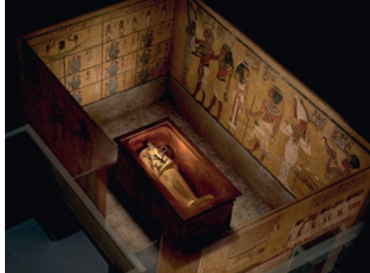
An example of a 3D reconstitution of a tomb

We will travel to England where the story's narrative unfolds. We will also work on a series of 2D and 3D images which focus on the tomb and its funerary objects, the king's body and its treatment, the city of Amarna, and the topography of the famous Valley of the Kings.