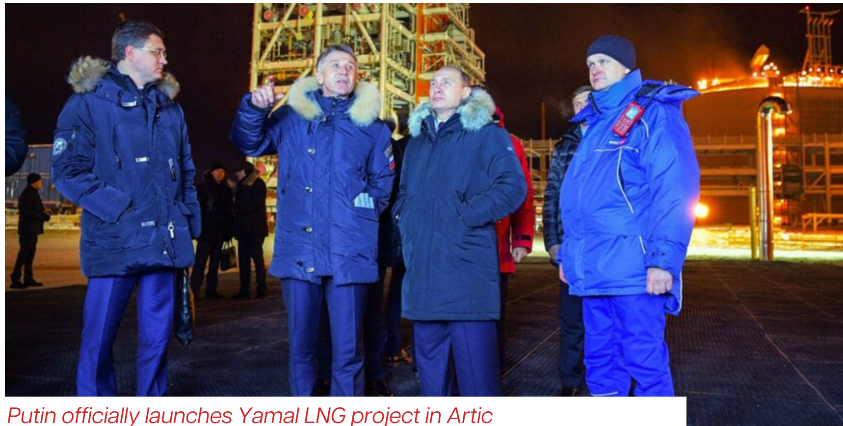
Putin officially launches Yamal LNG project in Artic

In 2014, the Russian Federation invaded and annexed the Crimean Peninsula,. But for the West, it was just business as usual . The son of a former KGB officer being nominated for a life peerage and entering the Lords, the Nord Stream 2 project being carried out and Yamal LNG project (Gazprom-Total) being officially launched are all proof of that. The oligarchs started to keep their distance from the Kremlin, gradually withdrawing from the oil and gas sector and establishing themselves in the West . They succeeded in providing a future for their children, who were trained in the best private schools and universities in the West. From now on, they'll be taking over.