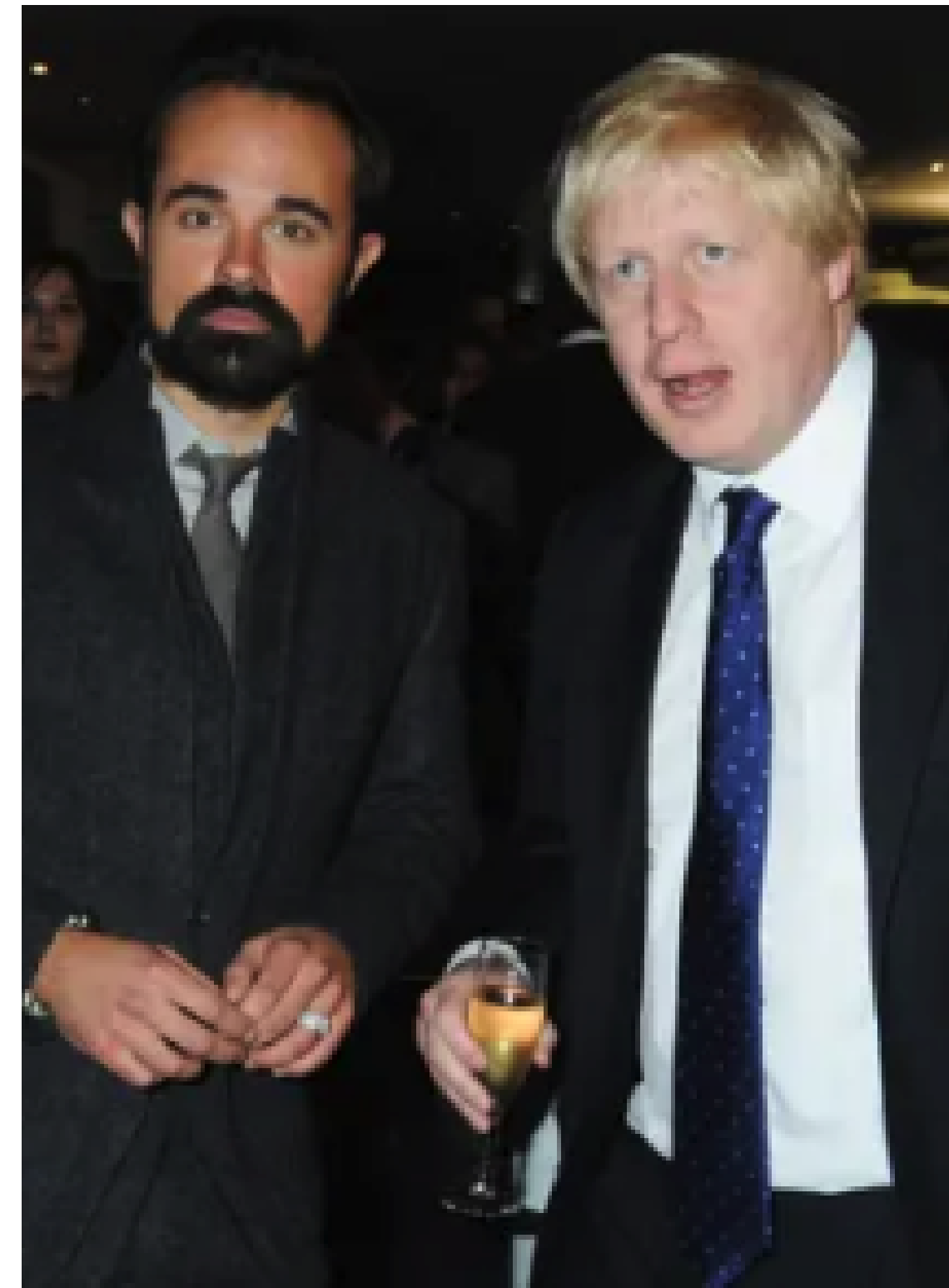
Evgeny Lebedev, son of Alexander Lebedev, a Russian oligarch, and Boris Johnson