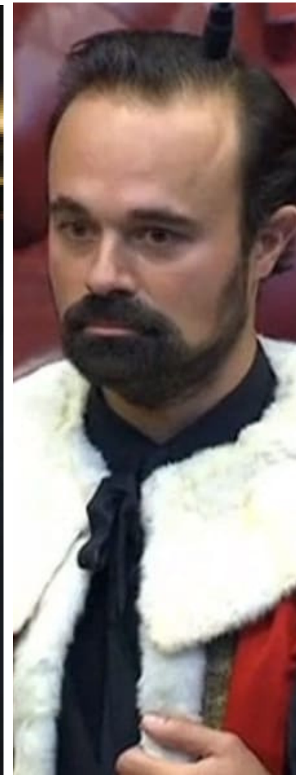
Evgeny Lebedev was nominated for a life peerage and has sat in the House of Lords as a crossbench life peer since 2020