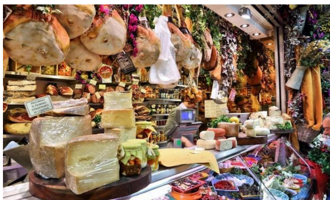
06 - IN THE BELLY OF FIRENZE 52' - 2015

PRODUCERS : MAJADE FILMPRODUKTION, ZWEITES DEUTSCHES FERNSEHEN