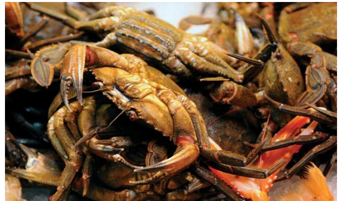
01 - IN THE BELLY OF BARCELONA 52' - 2013

An enchanting city, Barcelona is brimming with inspirations left by the greatest of artists. But this charming city has another jewel in its crown - La Boqueria food market.