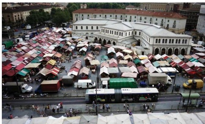
04 - IN THE BELLY OF TURIN 52' - 2013

At Europe's biggest open air market there is a world to discover! Torino's Porta Palazzo is a reverberating hub full of colours and people.