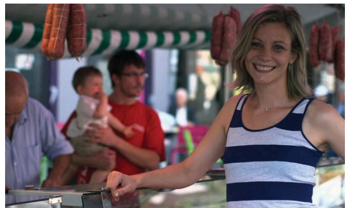
03 - IN THE BELLY OF LYON 52' - 2013

PRODUCERS : MAJADE FILMPRODUKTION, ZWEITES DEUTSCHES FERNSEHEN