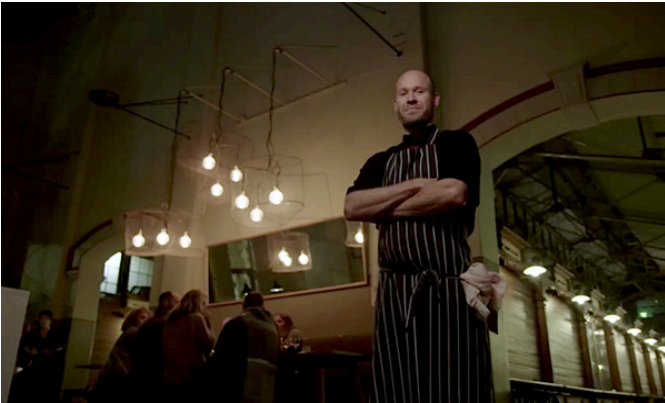
12 - IN THE BELLY OF HELSINKI 52' - 2017

Arriving by boat to the Baltic Sea Harbor of Helsinki it is the first building you see. Behind it the square and the great dome of the city hall. The Old Market Hall (Wanha VanhaKauppahall) is a beautiful little 19th century brick building with hi-varnish wooden stalls.