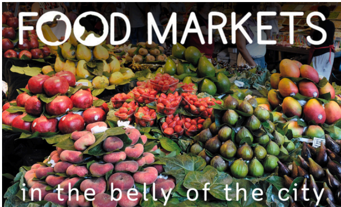
FOOD MARKETS 20x52' - 2024

24 markets, 24 complex systems that play a crucial role in their city : Barcelona, Budapest, Vienna, Lyon, Turin, Firenze, Toulouse, Zagreb, Riga, Freiburg, Amsterdam, Palermo, Helsinki... They all have a big belly: the city's food market that feeds a significant part of their population.