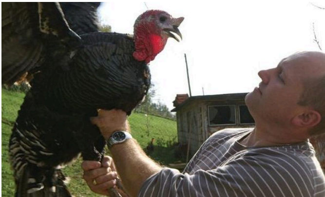
10 - IN THE BELLY OF ZAGREB 52' - 2015

DIRECTORS : STEFANO TEALDI, ULDIS CEKULIS