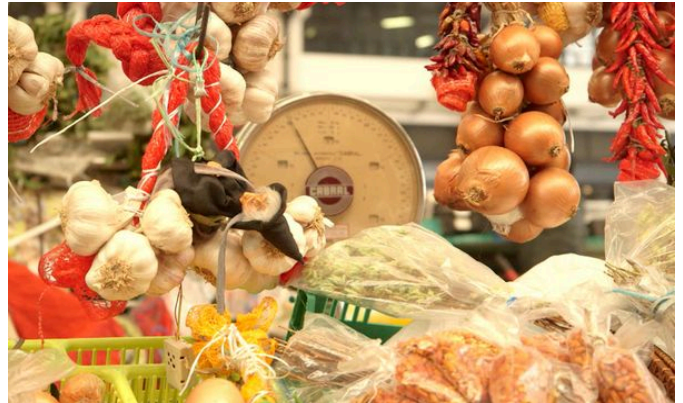
13 - IN THE BELLY OF LISBON 52' - 2017

"Mercado da Ribeira", in the Santos Area nearby Cais do Sodré train station, is opened since 1800 and is the city's oldest marketplace.