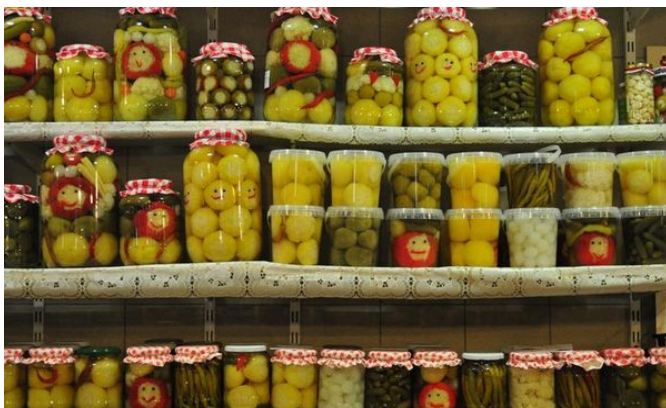
02 - IN THE BELLY OF BUDAPEST 52' - 2013

The largest indoor market in Budapest is also the most elegant in Europe! Spanning over three levels, the impressive central food market is long recognized as a marvel.