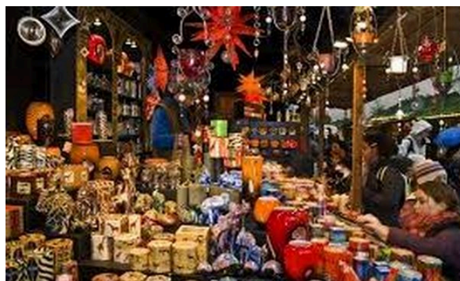
07 - IN THE BELLY OF FREIBURG 52' - 2015

PRODUCERS : STEFILM, ARTE DEUTSCHLAND TV GMBH, MAJADE FILMPRODUKTION, ZWEITES DEUTSCHES FERNSEHEN DIRECTORS : STEFANO TEALDI, VINCENZO CARUSO