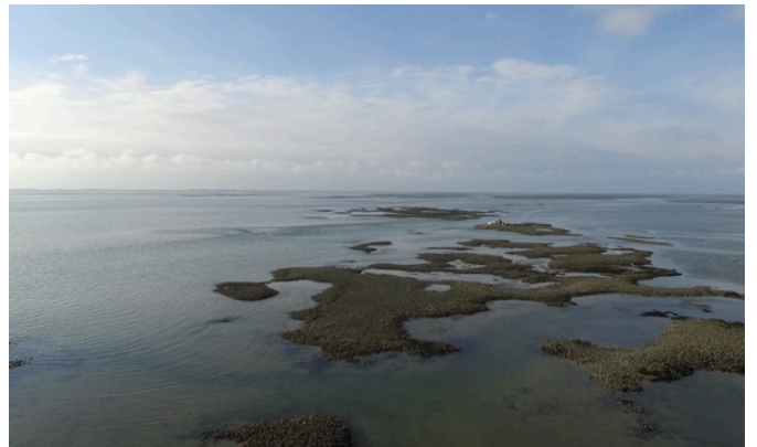
11 - IN THE BELLY OF AMSTERDAM 52' - 2017