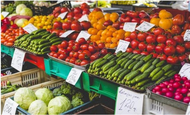
08 - IN THE BELLY OF RIGA 52' - 2015

The CentralTirgus is the biggest covered city food market in Europe. Just aside the Art Nouveau Old Town we find century old rye-bread making, grilled lampreys, soviet milk sausages and hemp butter.