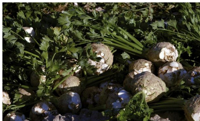
05 - IN THE BELLY OF VIENNA 52' - 2013

PRODUCERS : MAJADE FILMPRODUKTION, ZWEITES DEUTSCHES FERNSEHEN