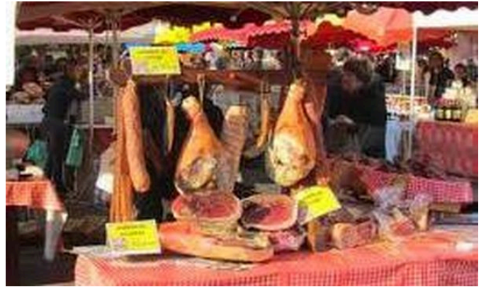
09 - IN THE BELLY OF TOULOUSE 52' - 2015

DIRECTORS : STEFANO TEALDI, DANA BUDISAVLJEVIC