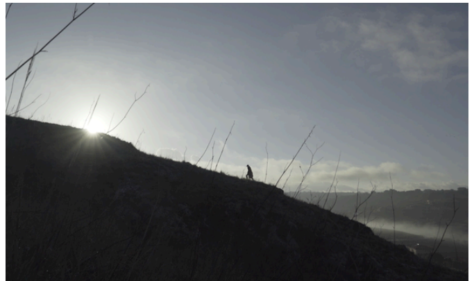
15 - IN THE BELLY OF PALERMO 52' - 2017

Placed in the middle of Palermo's ancient streets, it is almost difficult to walk. All around there is a swarm of colors and perfumes. The latter, chants of oriental flavor whose words are decipherable only by true experts, advertise the products on sale.