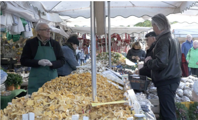
14 - IN THE BELLY OF MUNICH 52' - 2017