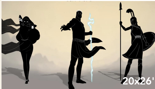
The Viking Myths