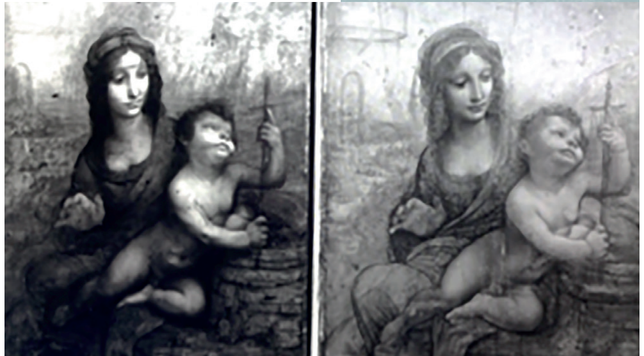
Infrared pictures of the Buccleuch and Lansdowne versions of the "Madonna of the Yarnwinder."

3D imagery and animation will be used to make this scientific, historical and artistic study entertaining as well as educational. Some episodes in da Vinci's life, along with daily life in his workshop, will be animated. The esthetic choice for the animation must obviously give a nod to the sketches of the master. Therefore, its style will be realistic, taut, austere, and rather minimal, with a touch of color to give it life and depth, while remaining very much Renaissance drawing. The 3D images will take a completely different approach by deconstructing the layers of da Vinci's paintings, as well as illustrating letters exchanged by the story's main protagonists. They will also recreate part of a museum which belonged to one of the most important collectors of his time, bring to life the Hall of Five Hundred in the Palazzo Vecchio in Florence, the only place where da Vinci and Michelangelo worked opposite each other. These 3D images will be a tool to reconstruct history as well as scientific research and artistic investigation, turning this sometimes-technical subject into an accessible and hopefully entertaining film.