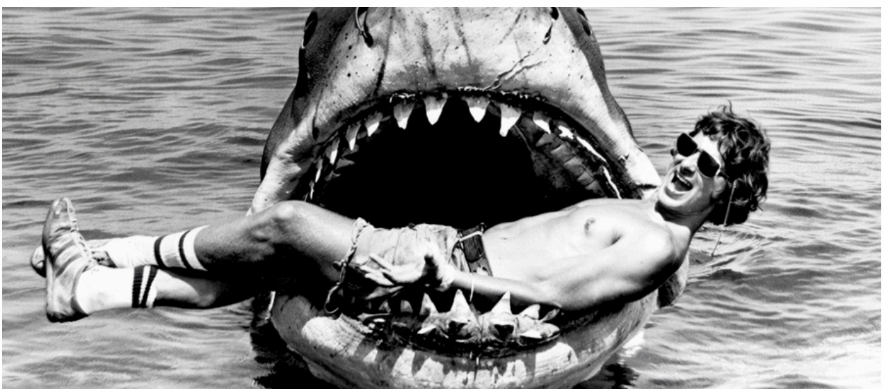
Steven Spielberg on the set of Jaws , 1975

This documentary explores Spielberg not through an exhaustive, film-by-film approach, but through the recurring obsessions that shaped his creative path. His life and work will be examined through three central themes: childhood, America, and the Holocaust.