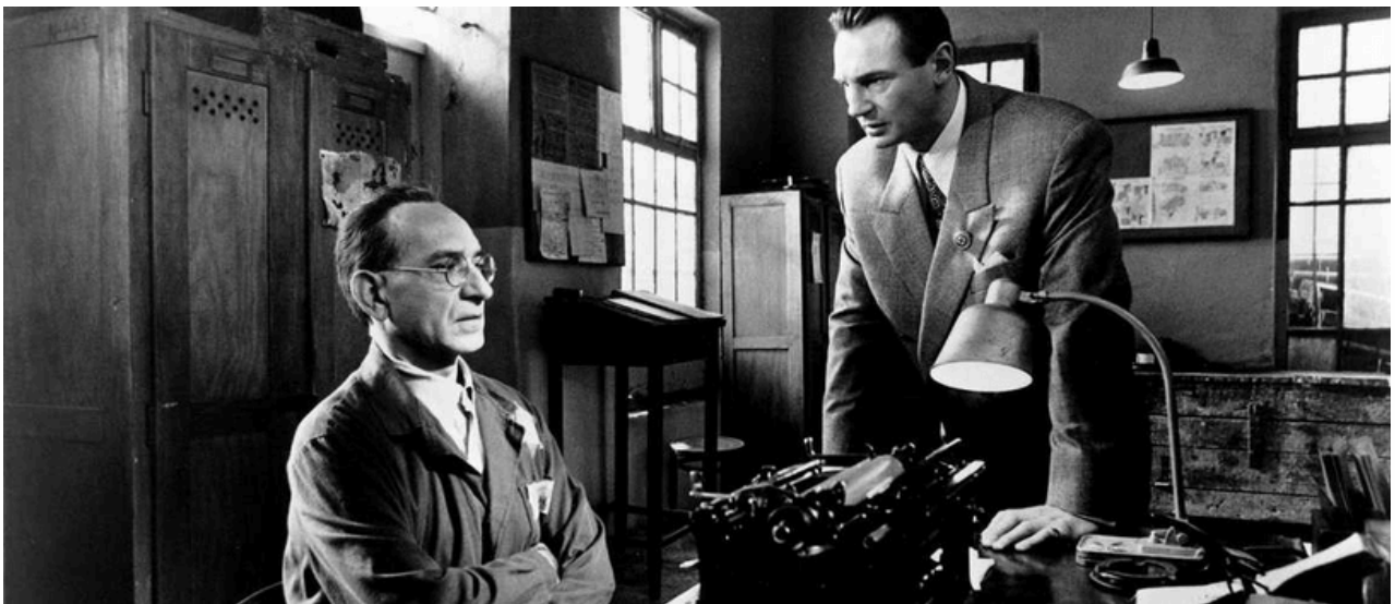
Schlinder's List, 1993