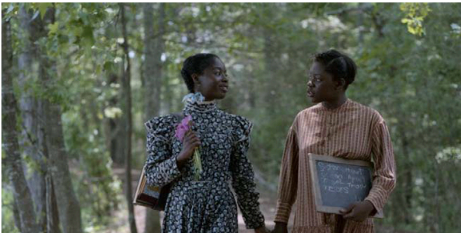
The Color Purple, 1985