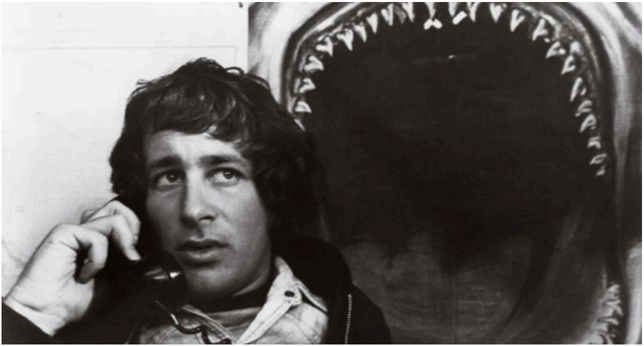
Steven Spielberg and the Jaws theatrical release poster, 1975