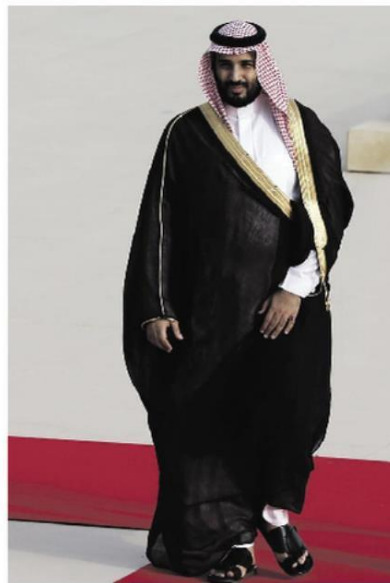
Mohammed Bin Salman (Saudi Arabia)